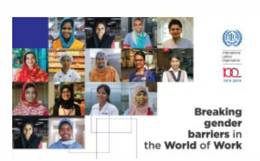
Breaking Gender Barriers in the World of Work